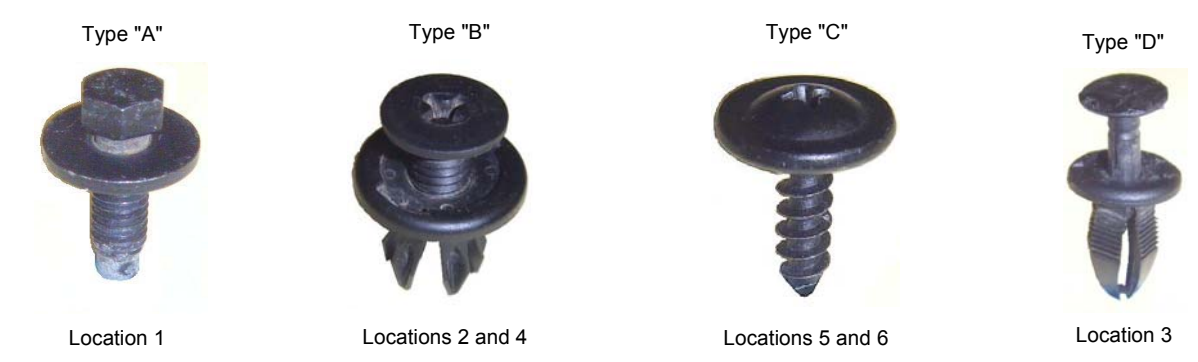
Photo 1: Fastener Types and Locations: "A" is a washer head hex screw, "B" are phillips head push fasteners, "C" are phillips head screws and "D" are push fasteners.

The stock bumper covers on the Mini Cooper S are attached to the vehicle with (11) fasteners. See Photo 1 for the types of fasteners used.