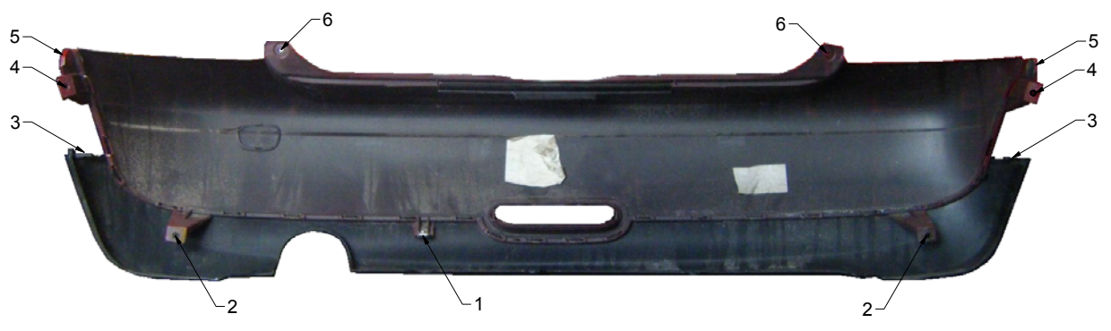
Photo 2: Fastener locations as viewed from inside of the bumper cover. (These fastener locations are present on all models.)